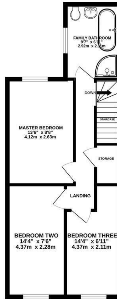
1ST FLOOR 467 sq.ft. (43.4 sq.m.) approx.